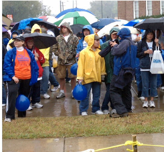
Walkers wait in the rain to take the 5K trek for awareness

More than 500 from around the Fox Valley walked to remember loved ones despite a drizzly 9/11 anniversary. It was the first suicide awareness walk held in the Valley. "Everyone has a